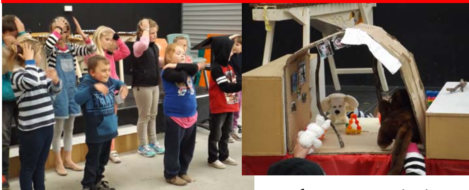
End of Term 3 Assembly Photos