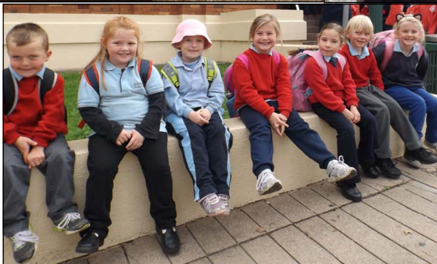
Tamworth Marsupial Park Visit 19/6/15