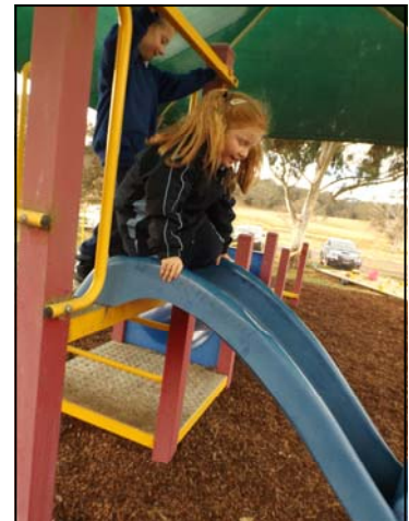
K/1/2 activities at Nowendoc last week