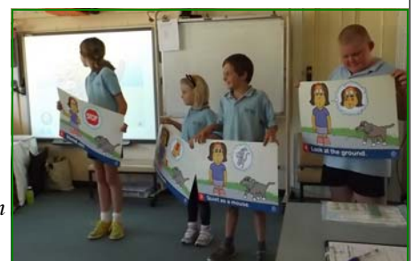
Pet program last week

The SRC are organising a school sleepover on Thursday 27th November. Details are yet to be decided but the children will go home on the Thursday and return for tea and activities. On Friday the SRC decided that everyone will stay in their pyjamas! Interesting!