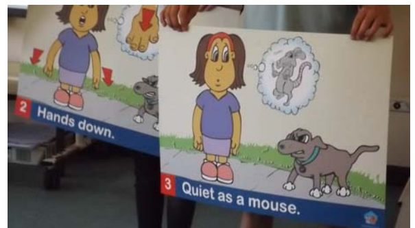
Pet Program presented at the school last week.