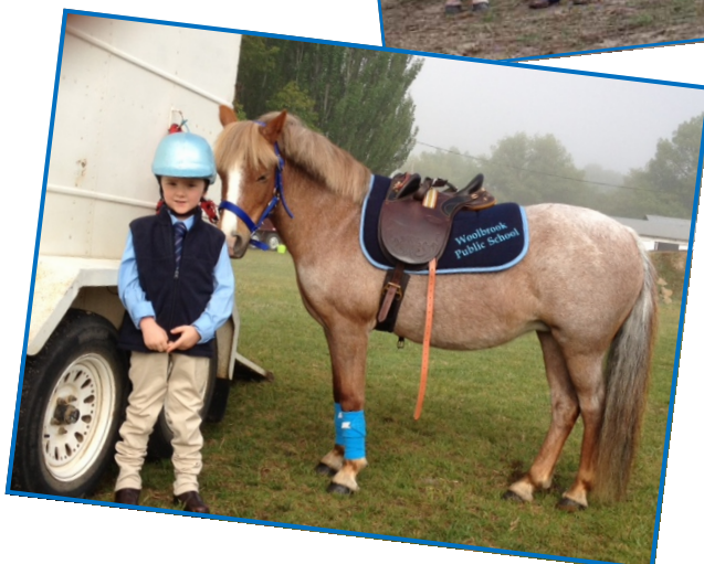
Horse Sports Activities