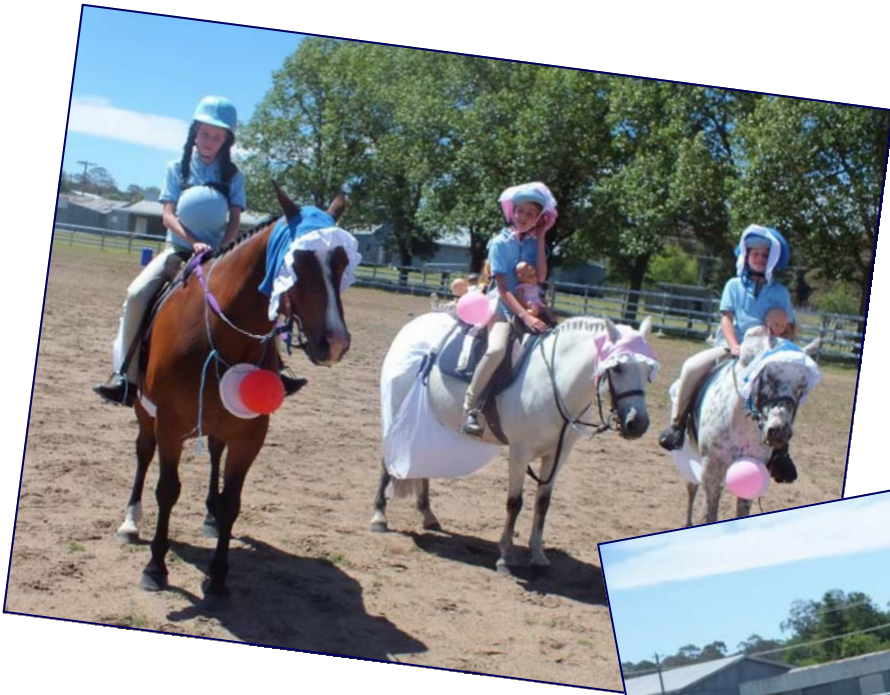
More Horse Sports.....